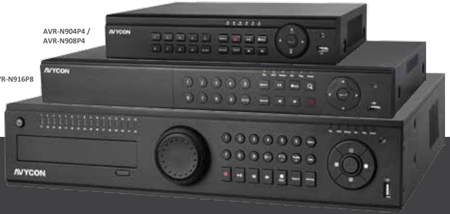
AVR-N904P4 / AVR-N908P4